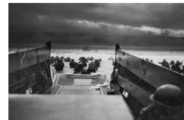
Allied forces arriving in occupied France