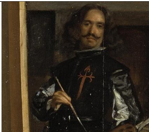
Diego Velázquez, 'Self portrait from 'Las Meninas'', 1656

Baroque period- A period in history from around 1630–1680 in Europe.