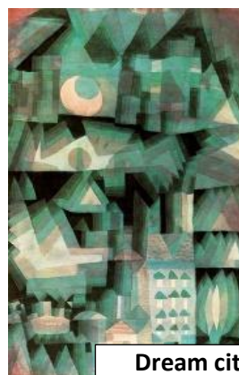
Dream city - 1921