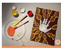
Making Aboriginal Dot Painting