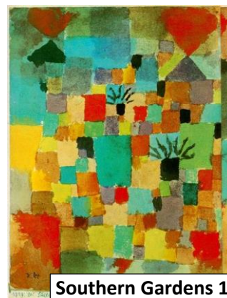
Southern Gardens 1919